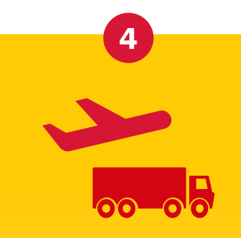
air or road.